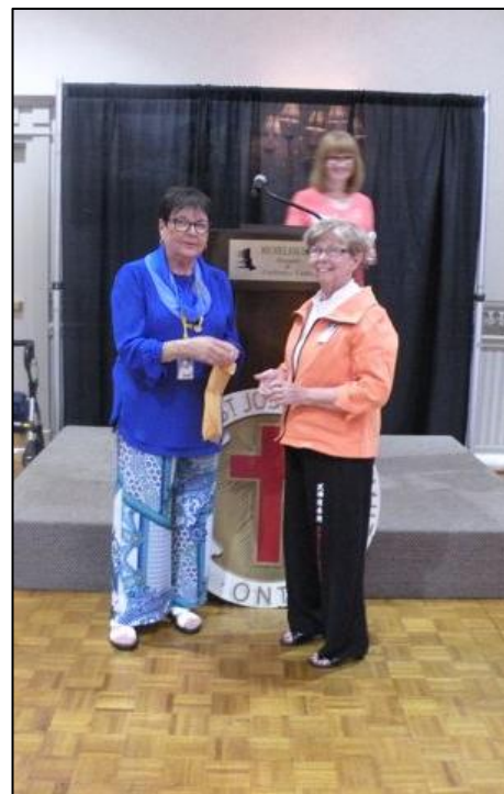
6 Alumnae members were to receive "Honorary pins"