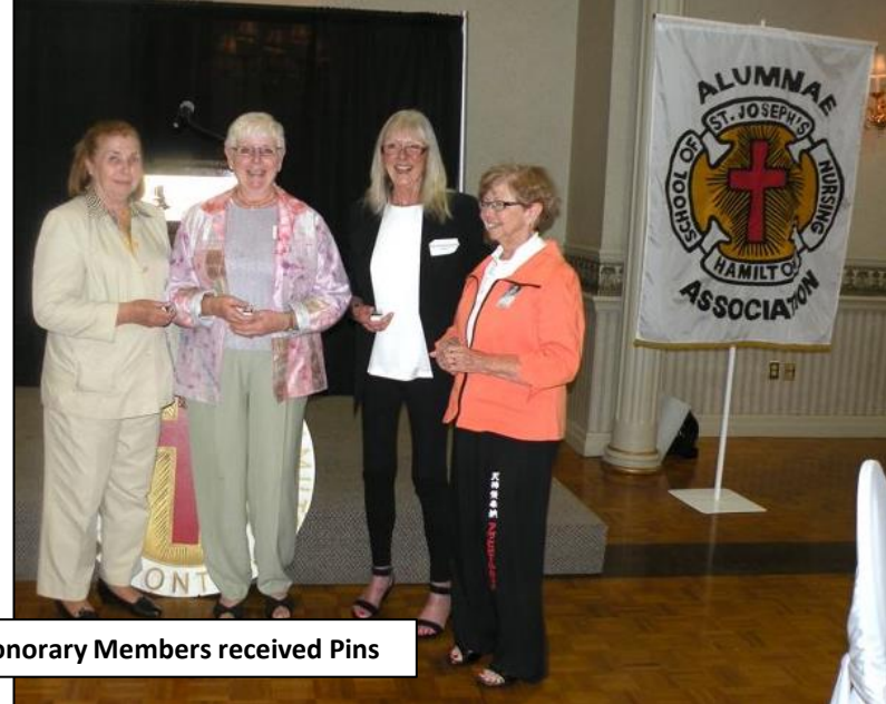
Honorary Members received Pins