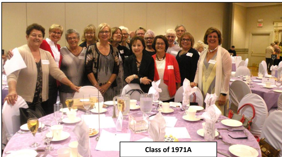
Class of 1971A