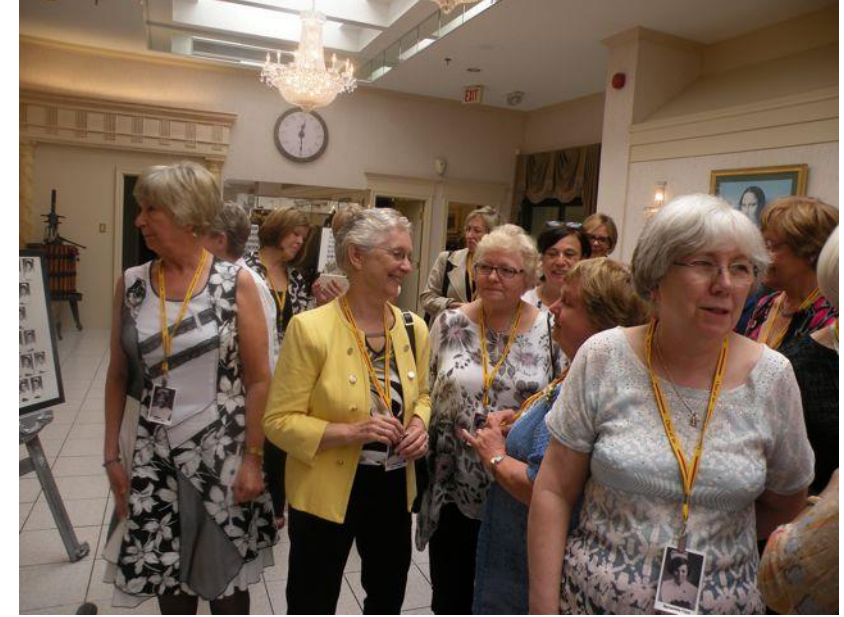
57 Members of the Class of 1966 – Celebrating 50 Years – Lining up to be piped into the Dining Room